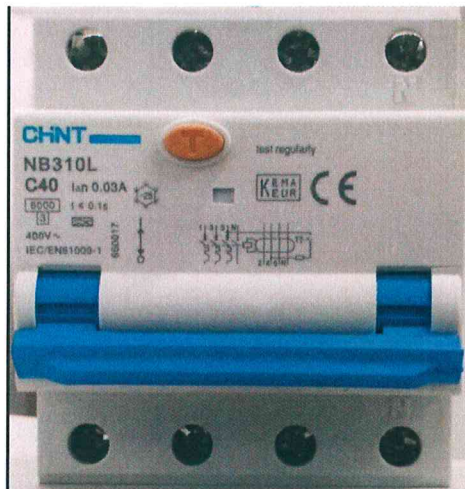
Images of NB310L

Signed for and on behalf of Zhejiang CHINT Electric Co., Ltd. Chint Industrial Zone, April 18, 2019